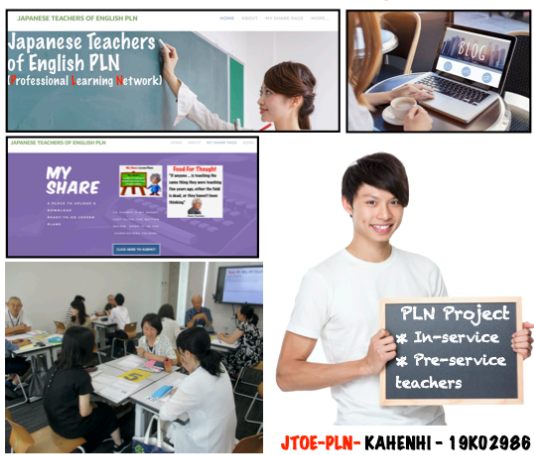
JTOE-PLN-KAHENHI - 19K02986