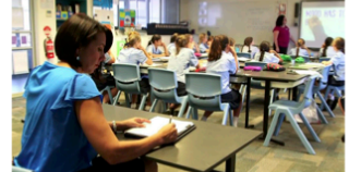
Peer Observation Cycle (O'Leary, 2014)