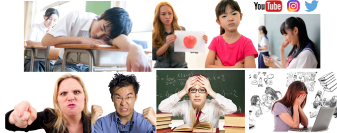
Isolation - "Egg carton profession" (Lortie, 1975)