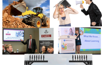
[often] "... fragmented, disconnected and irrelevant" (Lieberman & Pointer-Mace, 2010)